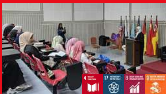
Faculty of Hotel and Tourism Management, Universiti Teknologi MARA in Penang

Specifically, the Personal Competency Development activities consisted of guest lectures and Focus Group Discussion.