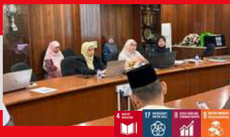
Focus Gorup Discussion (Hybrid) at Islamic Department . Ahmad Ibrahim Kulliyah of Laws, International Islamic University Malaysia