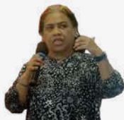
Member of the Honorary Council of PERADI 2026-2031

One tangible example of this contribution is reflected in the trust placed in Faculty of Law Universitas Sumatera Utara academics to hold important positions within national advocate professional organizations. This reflects recognition of their professional competence and contribution to the legal field to the development of the legal field in Indonesia. These roles are expected to further strengthen legal institutions, particularly in strengthening professional ethics and the quality of legal practice.