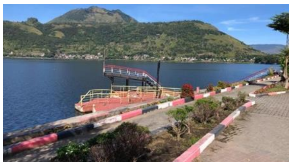
Fig. 3. Onan Baru Port (Reclamation Park)

Pelabuhan Street and Putri Lopian Street. Onan Baru Port is currently being revitalised with Reclamation Park, which later will be developed again into Waterfront City Pangururan (Figure 3). This is also supported by depth interviews with the key respondent: the Head of Lumban Suhi Toruan Village, "..If access in Pangururan Subdistrict is already okay. This area is passed through by Ringroad.."