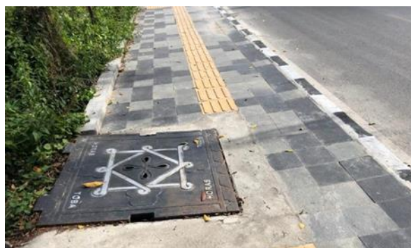
Fig. 7. Guiding blocks on Simanindo Roads, Pangururan

Fifth, facilities for people with disabilities in Pangururan District are still inadequate. The availability of ramps and guiding blocks has begun to be seen along pedestrian paths in the Pangururan region (Figure 5). Based on the results of the questionnaire, local people simply agreed that the availability of ramps for people with disabilities and the elderly to local community-run businesses with a value of 3, while tourists agreed with a value of 3,5 (Table 3). Local people simply agreed that the availability of guiding blocks for the visually impaired to local community-run businesses had a value of 2,9, while tourists agreed with that value of 3,6 (Table 3). Local people simply agree that ramp material and guiding blocks are environmentally friendly and can be easily traversed with a value of 3, while tourists simply agree with a value of 3,6 (Table 3).