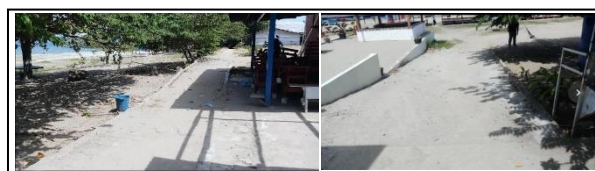
Fig. 5. Pedestrian Paths at Pantai Indah Situngkir

Fourth, pedestrian paths are sufficient and have been equipped with special paths for people with disabilities in some tourist areas. Based on the results of the questionnaire, local people strongly agreed that community-run local businesses are easily accessible to pedestrians with a value of 4,4, while tourists agreed with a value of 3,8 (Table 3). Local people agreed that pedestrian path material is safe and environmentally friendly with a value of 4,2, while tourists agreed with a value of 3,7 (Table 3). Based on the results of field observations, tourist areas that have provided pedestrian paths are Situngkir Indah Beach (Figure 4), Parbaba Beach and Onan Baru Port/Reclamation Park (Figure 5).