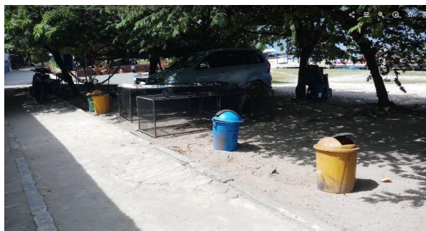
Fig. 4. Parking lots at Pantai Indah Situngkir

Third, the existence of parking lots. In Pangururan District, vehicle parking tends to lean more to on-street parking. Based on the results of the questionnaire, local people agreed with the availability of parking spaces for tourists with a value of 4, while tourists agreed with a value of 3,6 (Table 3). Some tourist destinations, such as Pantai Indah Situngkir provide parking in the beachside area (Figure 4). Access to the beach is observed to be in good condition, but it can only be passed by one car at a time with a road width of about 2.5-3 meters.