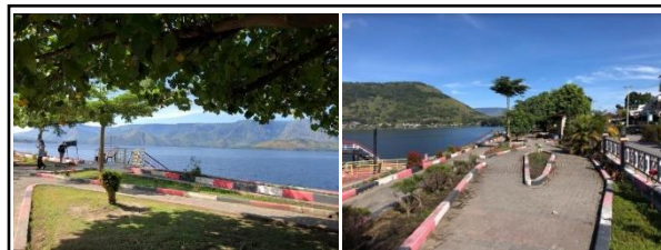
Fig. 6. Pedestrian Paths at Onan Baru Port (Reclamation Park)

Fifth, facilities for people with disabilities in Pangururan District are still inadequate. The availability of ramps and guiding blocks has begun to be seen along pedestrian paths in the Pangururan region (Figure 5). Based on the results of the questionnaire, local people simply agreed that the availability of ramps for people with disabilities and the elderly to local community-run businesses with a value of 3, while tourists agreed with a value of 3,5 (Table 3). Local people simply agreed that the availability of guiding blocks for the visually impaired to local community-run businesses had a value of 2,9, while tourists agreed with that value of 3,6 (Table 3). Local people simply agree that ramp material and guiding blocks are environmentally friendly and can be easily traversed with a value of 3, while tourists simply agree with a value of 3,6 (Table 3).