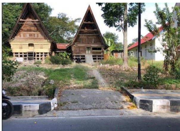
Fig. 8. Ramp in front of citizen's house